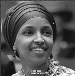
ILHAN OMAR U.S. REPRESENTATIVE